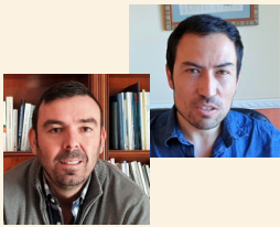
Sempere & Fuenzalida

Interfamily Therapy: supporting families to support one another and find their own solutions drawing on attachment principles